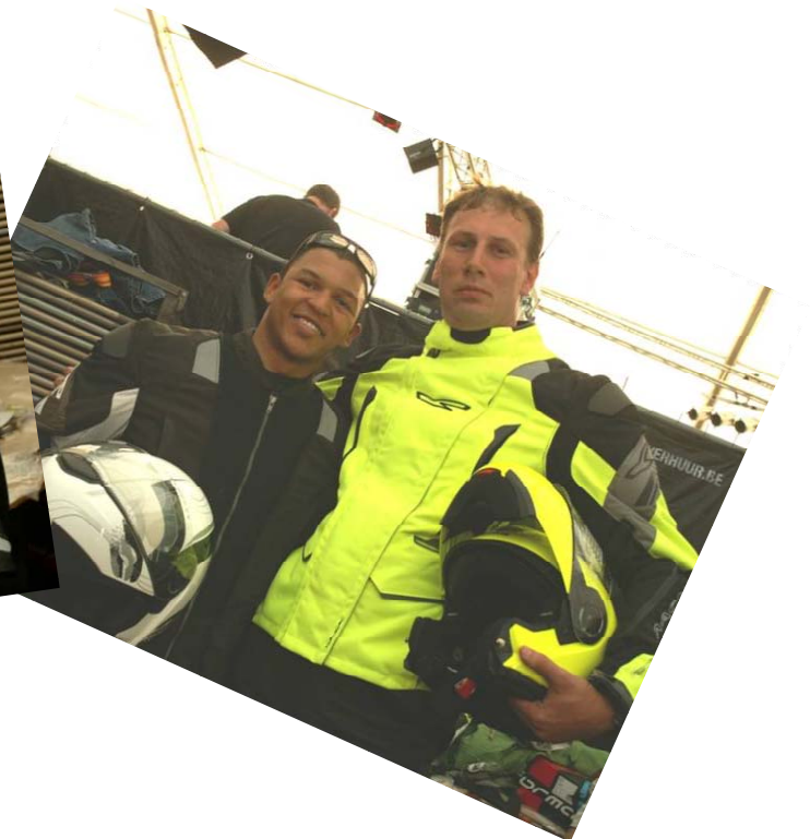
A happy crowd!