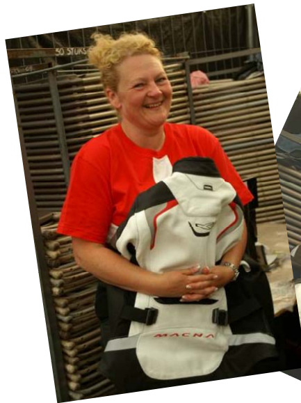
Danish, Saudi and Russian models proudly wearing Macna and SchubertH gear

Fashion show attendees were given catalogs and special pens from Macna.